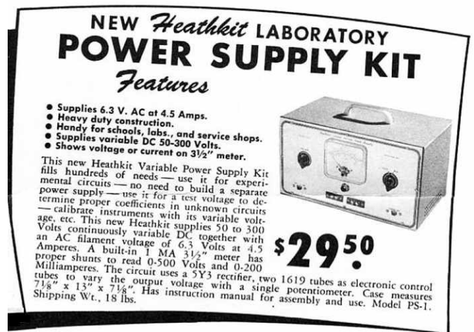
Figure 2: PS-1 Ad from 1951 Heathkit Flyer

Three tubes are used in the PS-1. A 5Y3GT rectifier tube and two paralleled 1619 series regulator tubes. The 1619 was a common tube that was mass produced during WWII. In 1971 TAB sold surplus 1619 tubes at 5 for a dollar. Heath probably obtained them at even a lower price. They might have been included in the mass surplus component buys Heathkit made in their early days. The 1619 has a 2.5 V filament requiring a separate transformer or isolated winding. Since the filament or cathode in these circuits is at a high voltage this requirement is universal across the various family of kits.