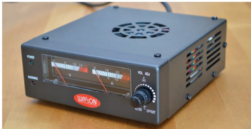
The Watson Power-Mite-NF is a compact 13.8V 25A switching-mode power supply.