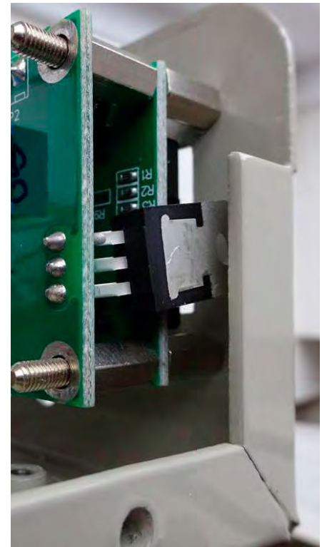
Fig. 4: The correct orientation of the display and Arduino boards.

I'll report back to readers in a future What Next on my experiences of using the BITX40 on the air. Suffice to say that I am hearing plenty of LSB signals on 40m against a quiet background. ○