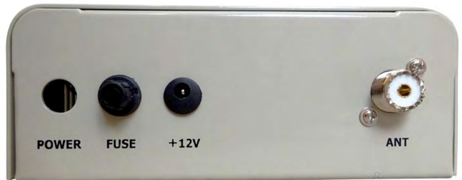
Fig. 3: The rear panel with the connectors and fuse installed. The hole labelled Power is for an alternative power supply for the PA stage (see text).

www.hfsignals.com/index.php/2017/11/23/wiring-up-the-bitx40