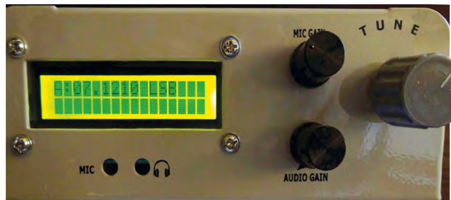
Fig. 5: The almost finished project.